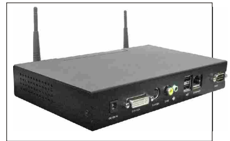
(WLAN & RS232 is Optional)